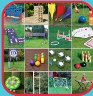
Games for all NEW: Games for Middle Schoolers